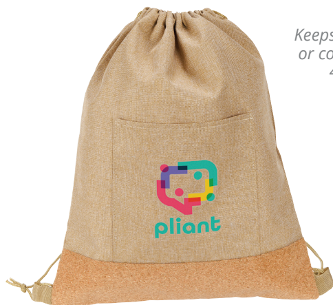
Carina RPET & Cork Drawstring Backpack WBA-CD23

The combination of 600D RPET polyester and decorative cork trim gives a new upgrade to these classic styles of bags. The two materials blend together to create a tone-on-tone look for an elevated look.