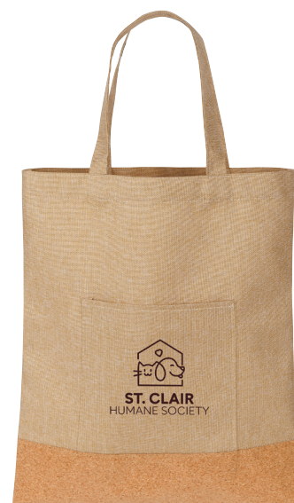
Carina RPET & Cork Tote Bag WBA-CT23