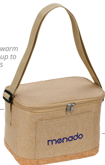
Carina RPET & Cork Insulated Cooler Bag WBA-CC23

Keeps food warm or cool for up to 4 hours